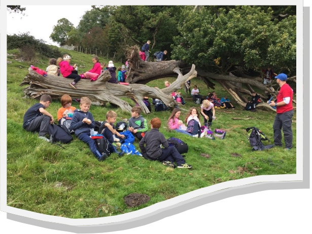
YEAR 4 RESIDENTIAL TO HUMPHREY HEAD.

After requests from parents, we now have elasticated school ties available to purchase at £3 each. If you would like a non-elasticated tie, please let us know.